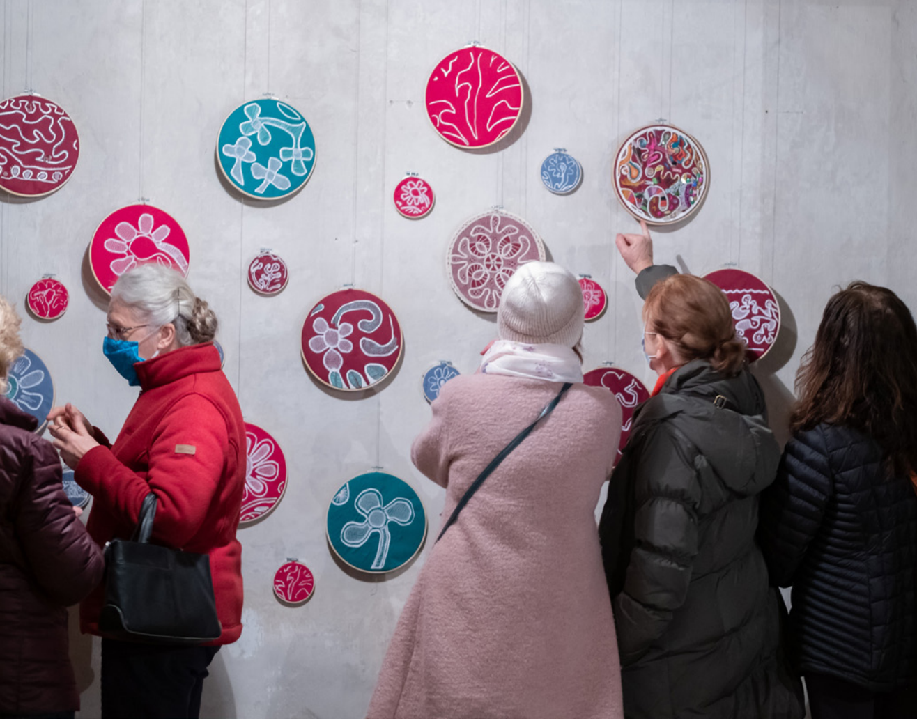
Exhibition opening and project participants of Borris Lace by Post , Creativity in Older Age Scheme Project , Carlow.

Climate Change Adaptation Strategy 2019–2024 “Ensure a proper comprehension of the key risks and vulnerabilities of climate change.” “Bring forward the implementation of climate resilient actions in a planned and proactive manner.” “Ensure that climate adaptation considerations are mainstreamed into all plans and policies and integrated into all operations and functions of the local authority.”