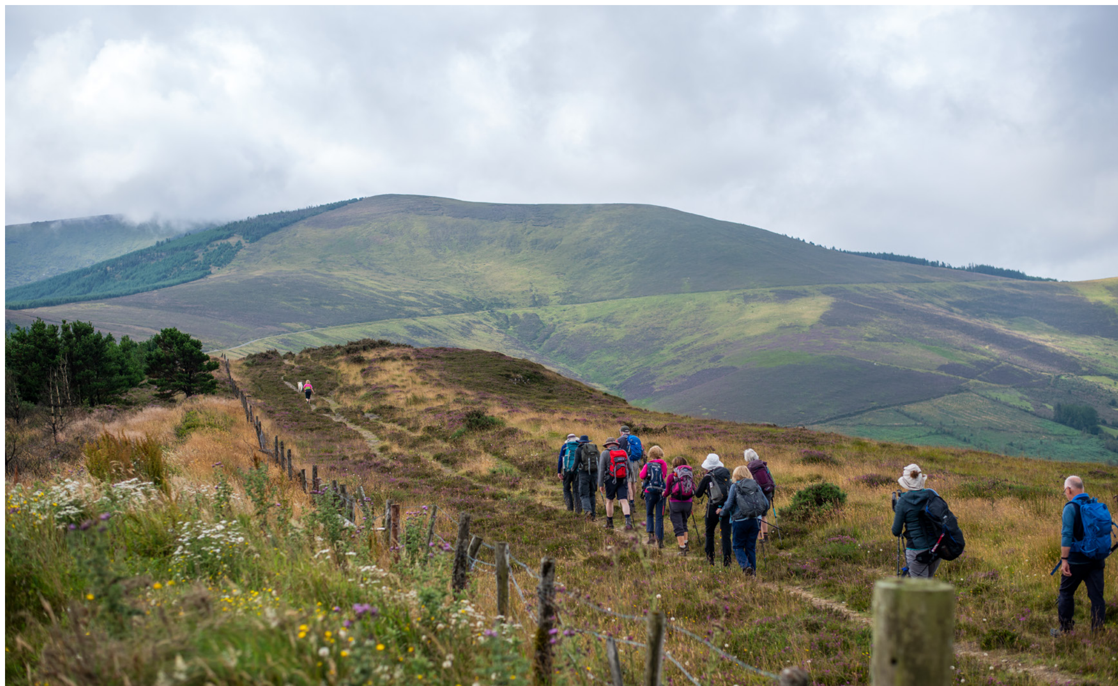
The Columban Way walking trail through the Black Stairs Mountains, Co. Carlow.