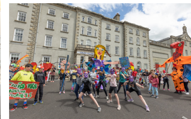
Cruinniu na n'Og 2022, Carlow Carnival of Collective Joy, Carlow.