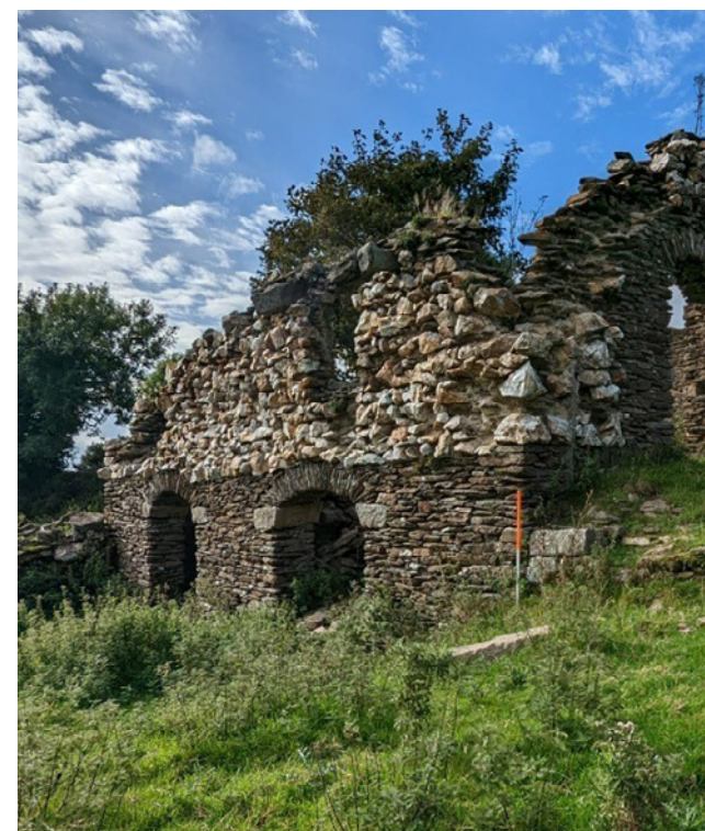
Scabby House, Raheenkyle, nineteenth-century vernacular stone structure near Borris Co. Carlow.