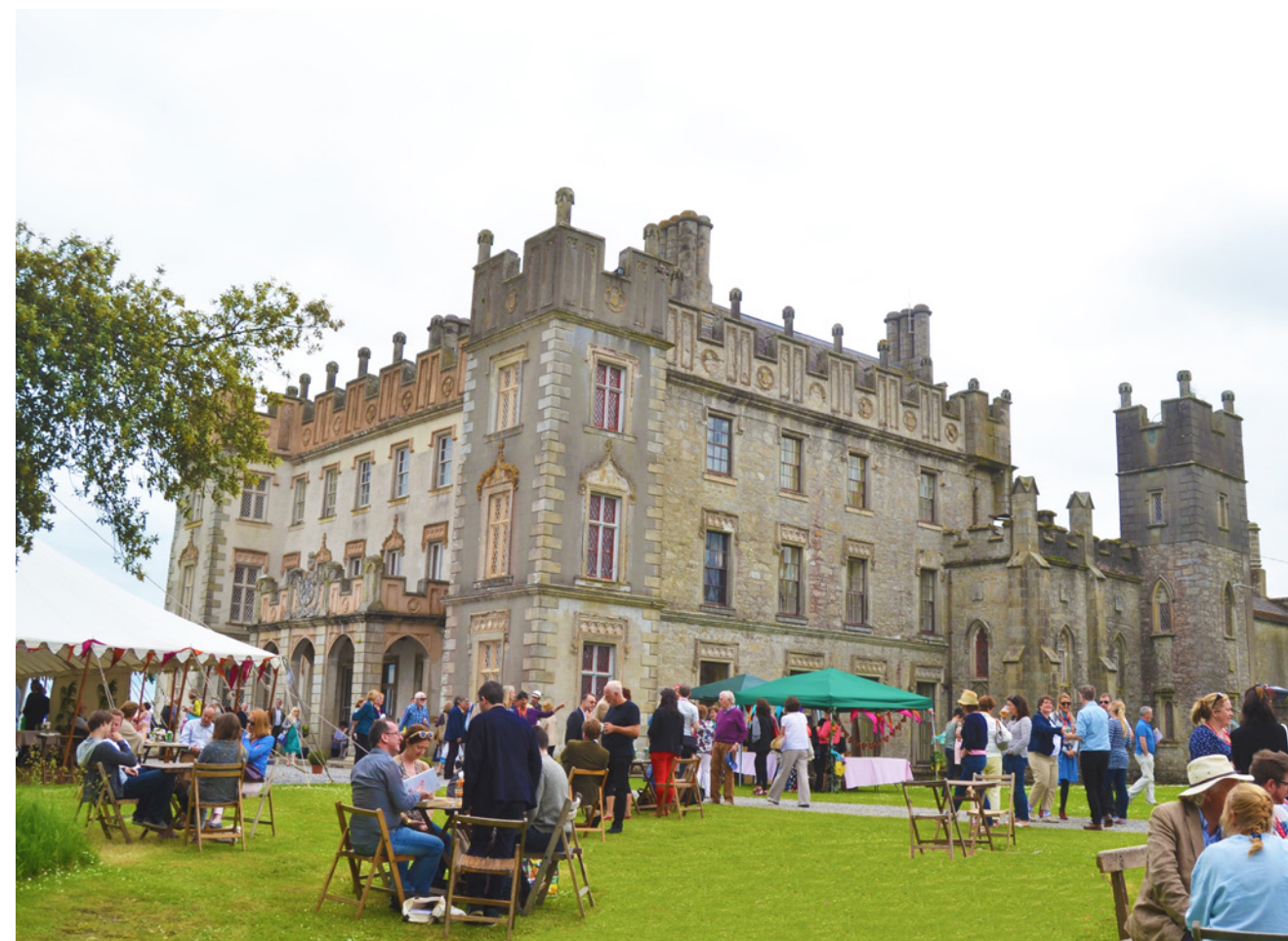
Borris House, Borris, Co. Carlow.

The opportunity embraced within the Carlow Culture and Creativity Strategy 2023–2027 is to support people's participation, inclusion and expression within communities, and further strengthen local creative economies.