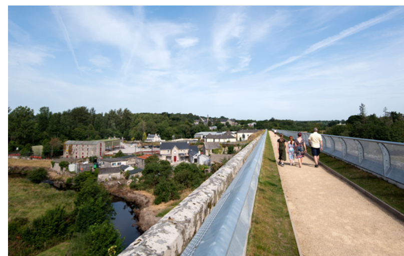
The River Barrow, Go with The Flow River Adventures, Clashganny, Co. Carlow.