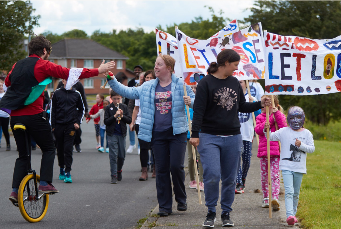
Cruinniu na n'Og 2019, Take A Part Carlow "Let Loose" parade, featuring Dublin Circus Project, Carlow.

For a small county Carlow is artistically rich, animated daily by our artists, designers, creators and communities, all of which are significantly recognised for contributing to the well-being of the place and enabling people to stay connected and feel a sense of belonging. Culture is also celebrated in the habitual, everyday acts of playing music, singing, dancing and gathering together to share folklore and stories. Carlow is also proud host to Glór Cheatharlach, a local organisation committed to the promotion of the Irish language and culture in Carlow since 2008.