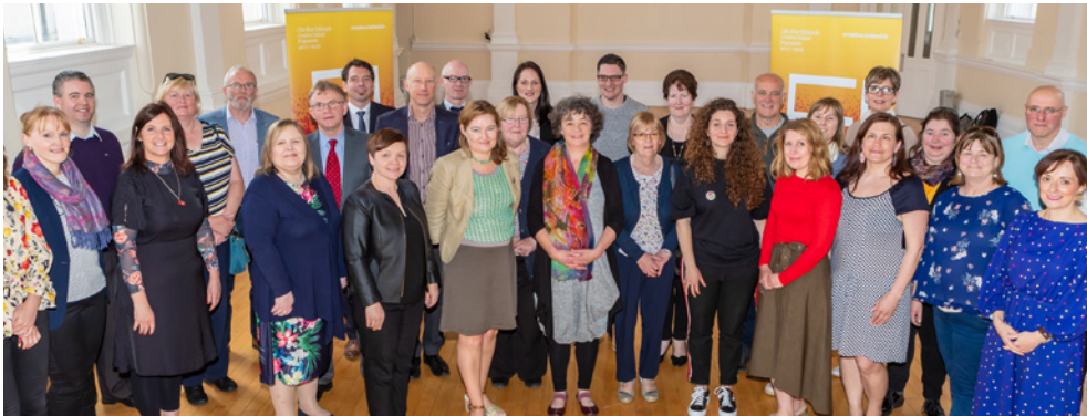
Creative Ireland Grant recipients and Carlow Culture and Creativity team members. Carlow.