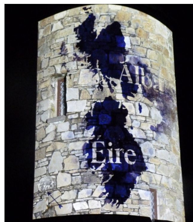
Projection at Colmuille Heritage Centre as part of 'Coinneal Cholmuille' illuminations across Ireland and Scotland to mark Colmuille's 1500th birthday