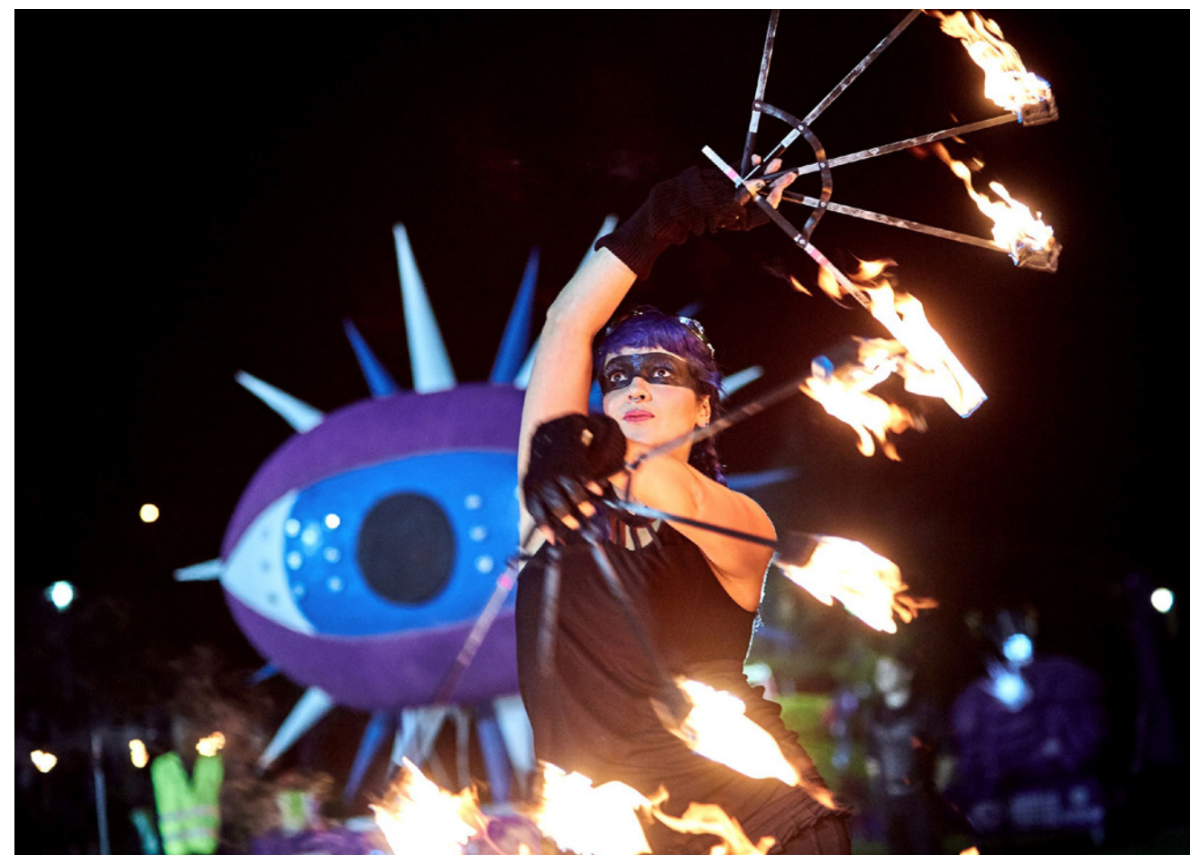
A fire performer in Inishowen Carnival's Cybertribe spectacle, at Bernard McGlinchey Town Park, Letterkenny, on Culture Night 2019