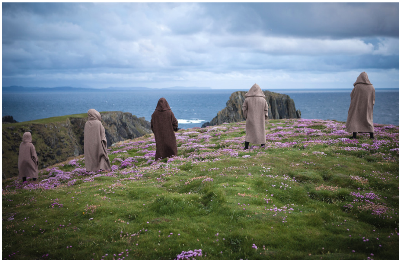
The Gathering of the Force, an Open Call submission for Cruinniú na nÓg in 2020 which combined young people, Tai Chi, Star Wars, film and the breathtaking scenery of Banba's Crown, Malin Head

There is also an extensive number of craft initiatives throughout the County including Donegal Craft Village, Local Hands, Ballyshannon and the Donegal Designer Makers network.