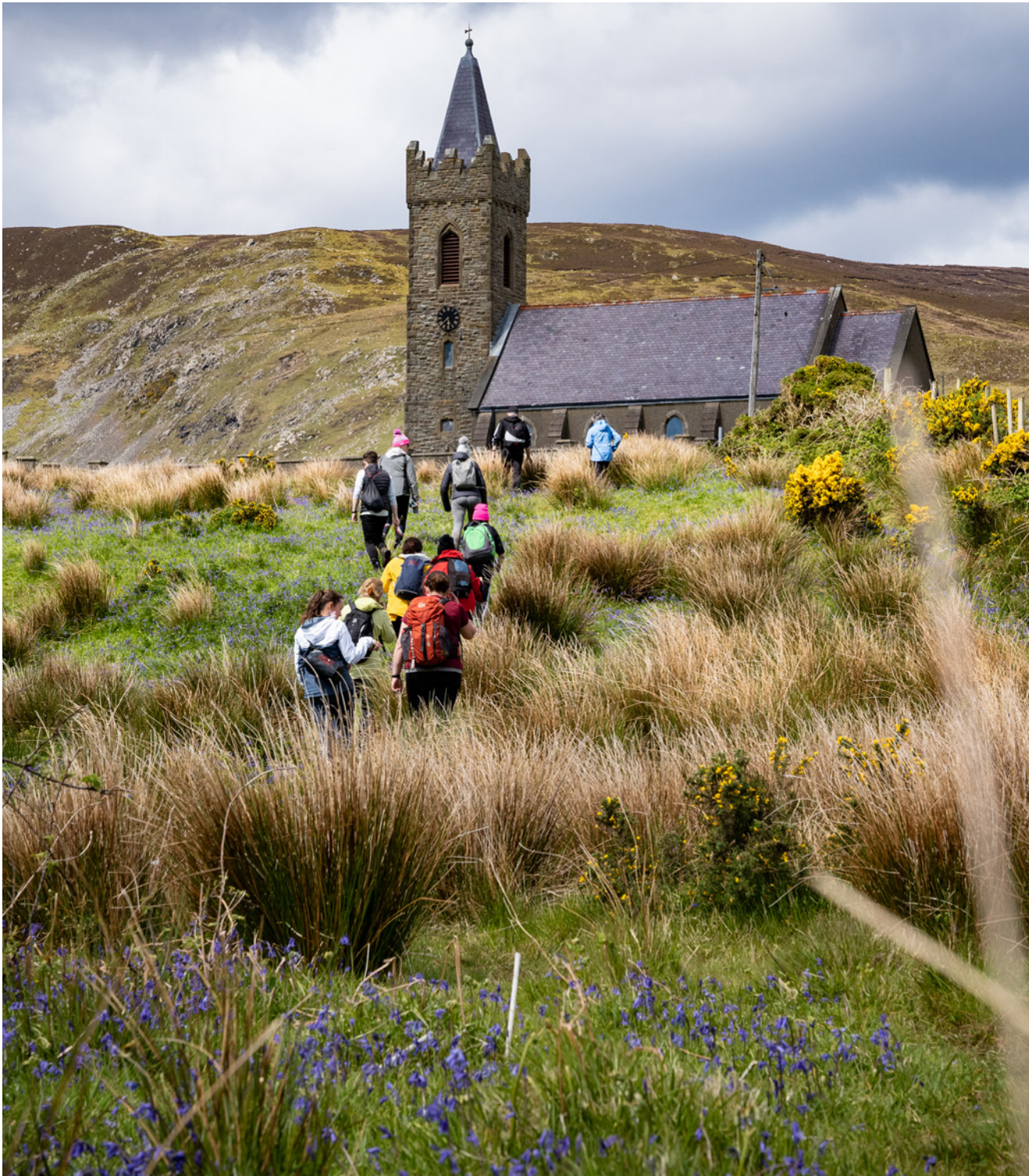
Gleann Cholm Cille : An Áit agus a Naomh —A project to digitize the minor placenames of Gleann Cholm Cille, Colmcille 1500 Grant Scheme

Spraoi agus Sport 2020 – online and location-based workshops for the creative industry using the resources of the FabLab. Feedback included, “very good and informative”, “helping me get my creative mojo back”.