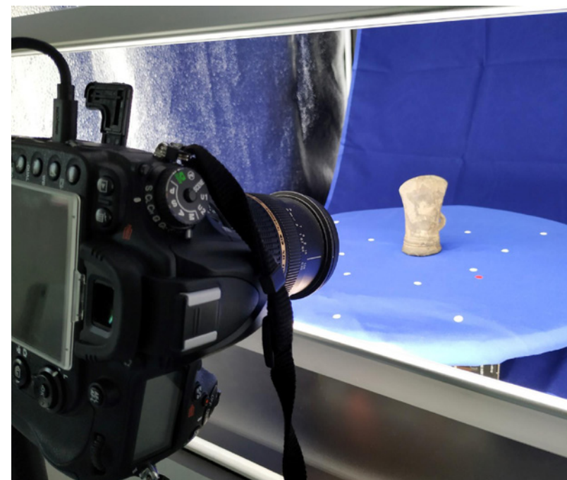
Bronze socketed axe head pictured during a 3D photogrammetry session Photograph: Jurand Macioszyk, 2018