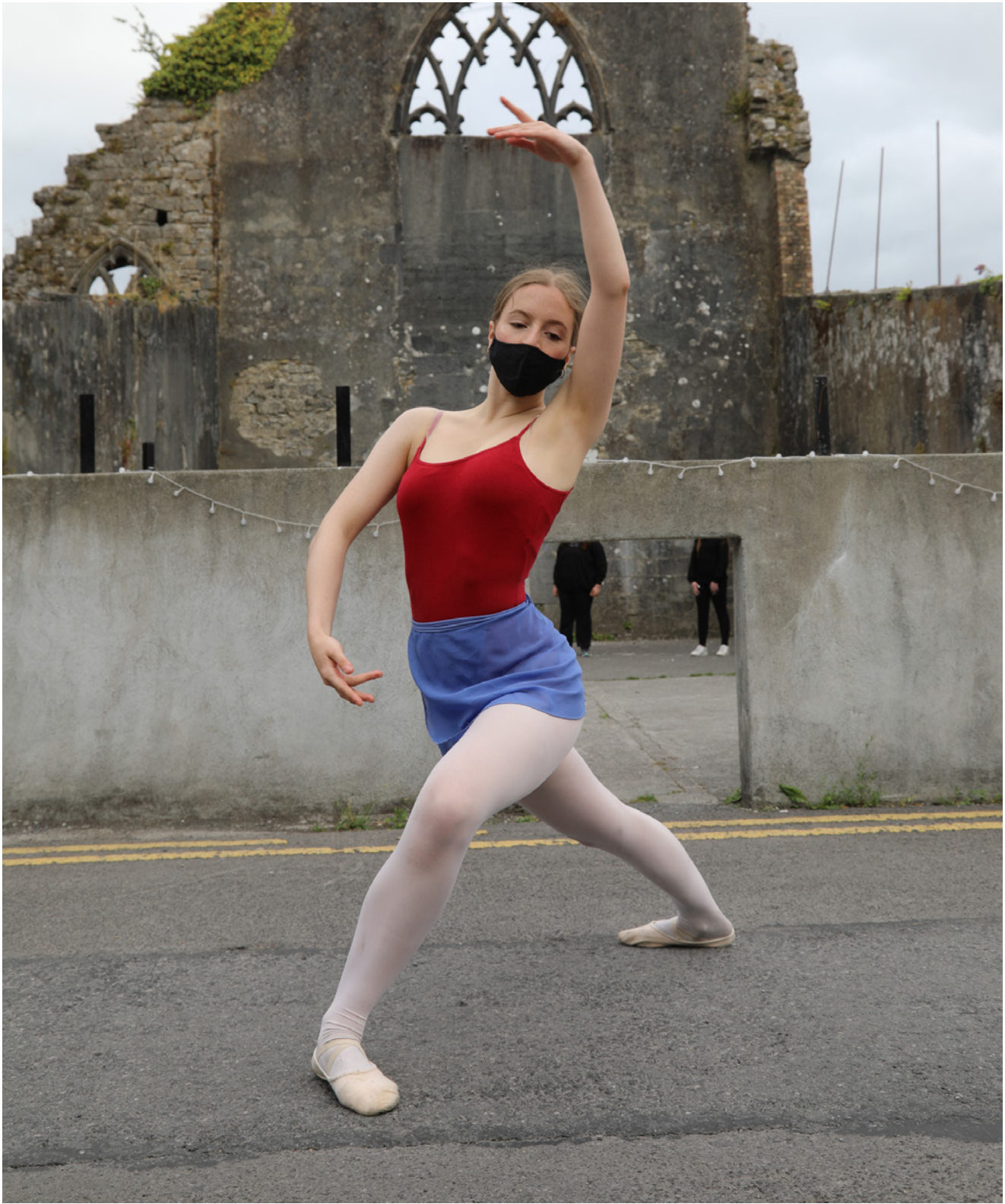
Bouncing Off the Walls.