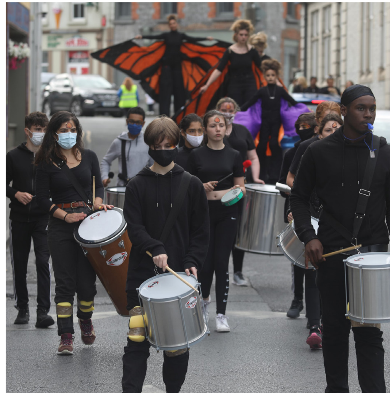
Bouncing Off the Walls.

The opportunity embraced within the Galway County Culture and Creativity Strategy 2023–2027 is to support people’s participation, inclusion and expression within communities, and further strengthen local creative economies.