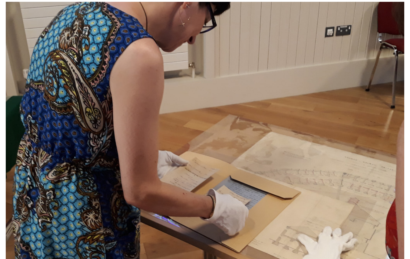
Sewing a Seed: Archives to Art.

with nursing homes to keep residents engaged through stories and song, culminating in a participatory event for their families and communities, and a DVD to support the process of transmission of folklore from older people to children in the community.