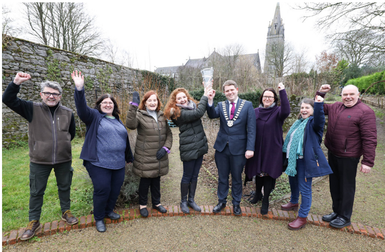
Abbeyleix Climate Action Project, winner of the Sustainable Communities category in the Chambers Ireland Excellence in Local Government Awards 2021.

The Festival of Flight led by the Col Fitzmaurice Commemoration Committee was in partnership with Laois County Council Heritage Office, Creative Laois, Laois Heritage Society, Music Generation Laois, Dunamaise Arts Centre, Midlands Science, and the Heritage Council. This multidisciplinary festival featured a maelstrom of activities including: