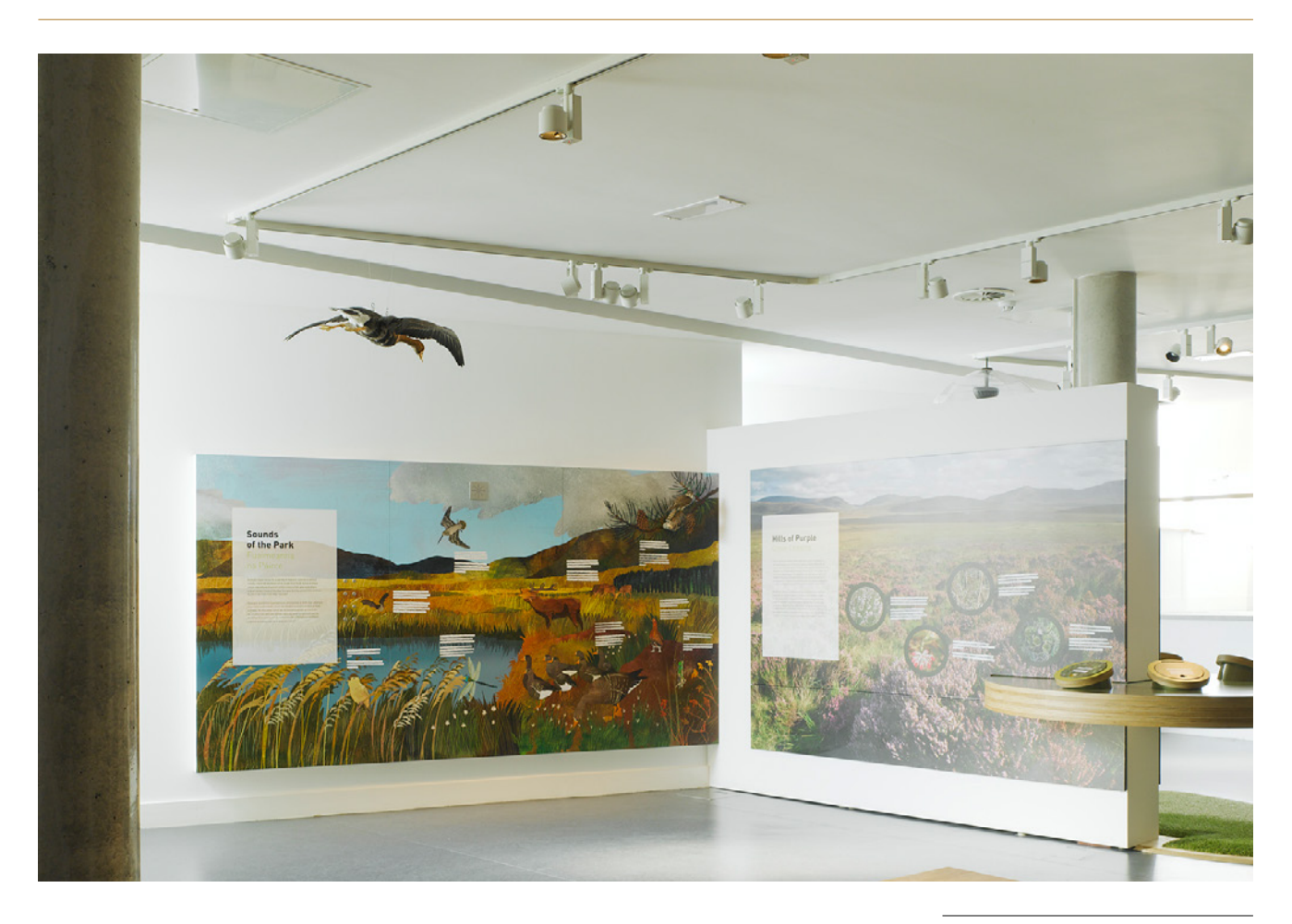
Wild Nephin National Park Visitors Centre, Ballycroy Co Mayo- Tourism Department, Mayo County Council

Mayo County Council has fully embraced the aims and ambitions of the Creative Ireland Programme. Its values of Collaboration, Communication, Community, Participation, Inclusivity and Empowerment are also our values. Mayo County Council is committed to leading, developing and working in partnership to create and support opportunities for all citizens to engage in inclusive and diverse cultural experiences. We work on the principle of partnership and genuine inclusion, both internally and externally. Music Generation Mayo is a good example of how this works in practice.