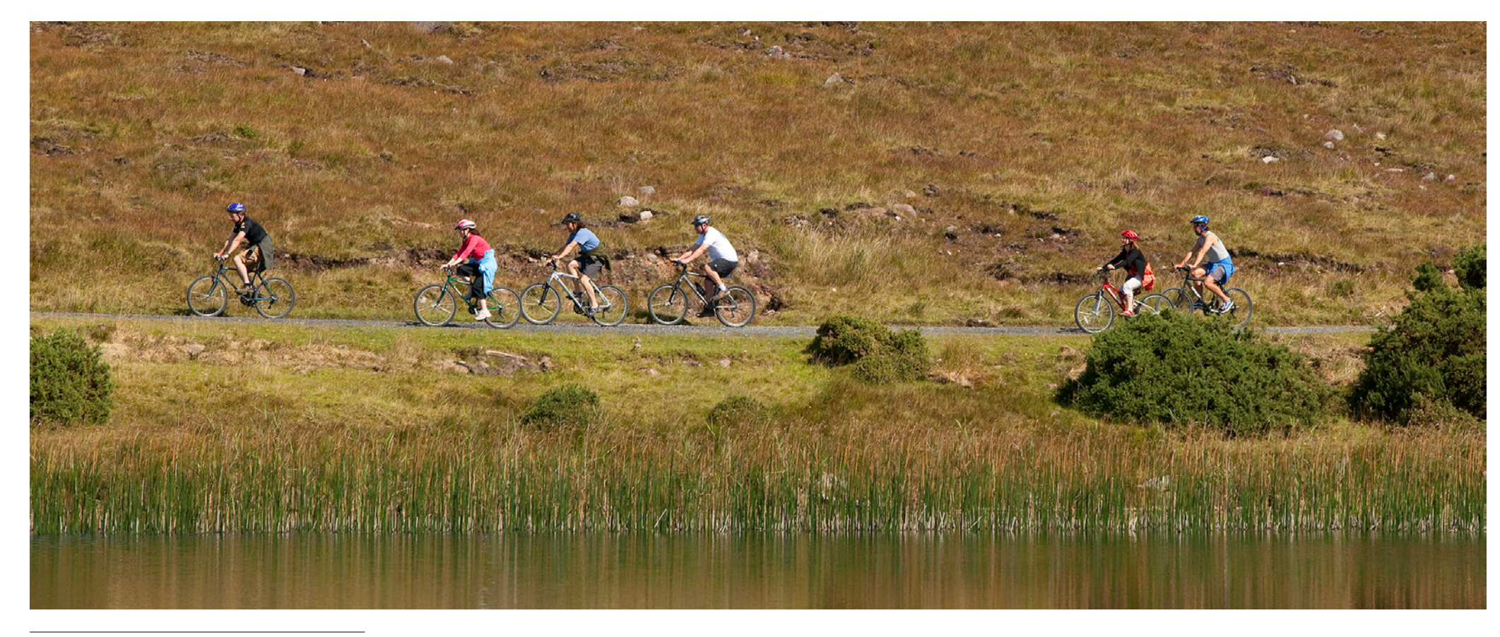
Great Western Greenway, Co. Mayo

Mayo County Council will continue to position culture, heritage and creativity centrally within its corporate policies, recognising the role they have in all aspects of the county's life: from community