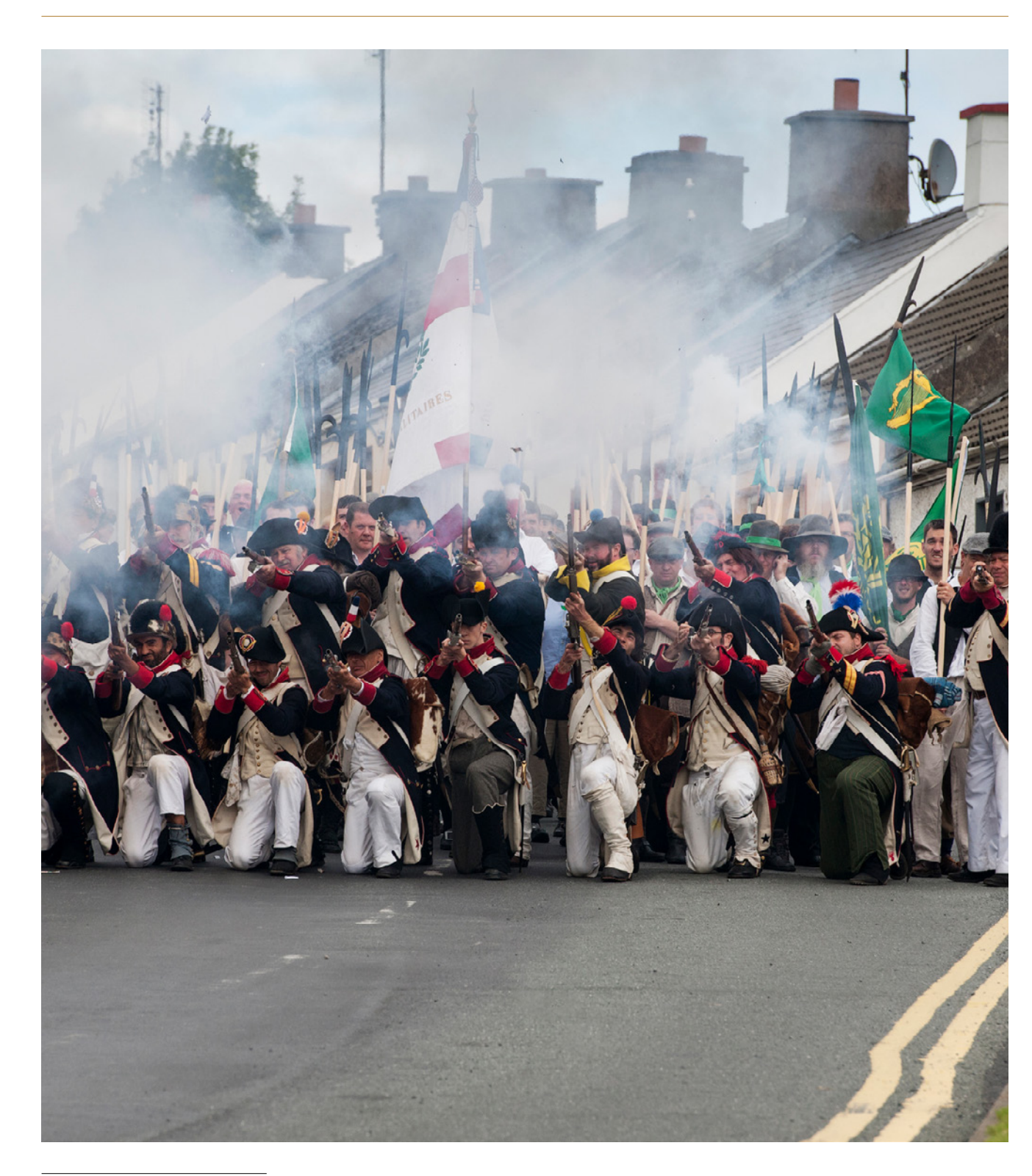
Races of Castlebar, 1798 recreation – Tourism Department, Mayo County Council