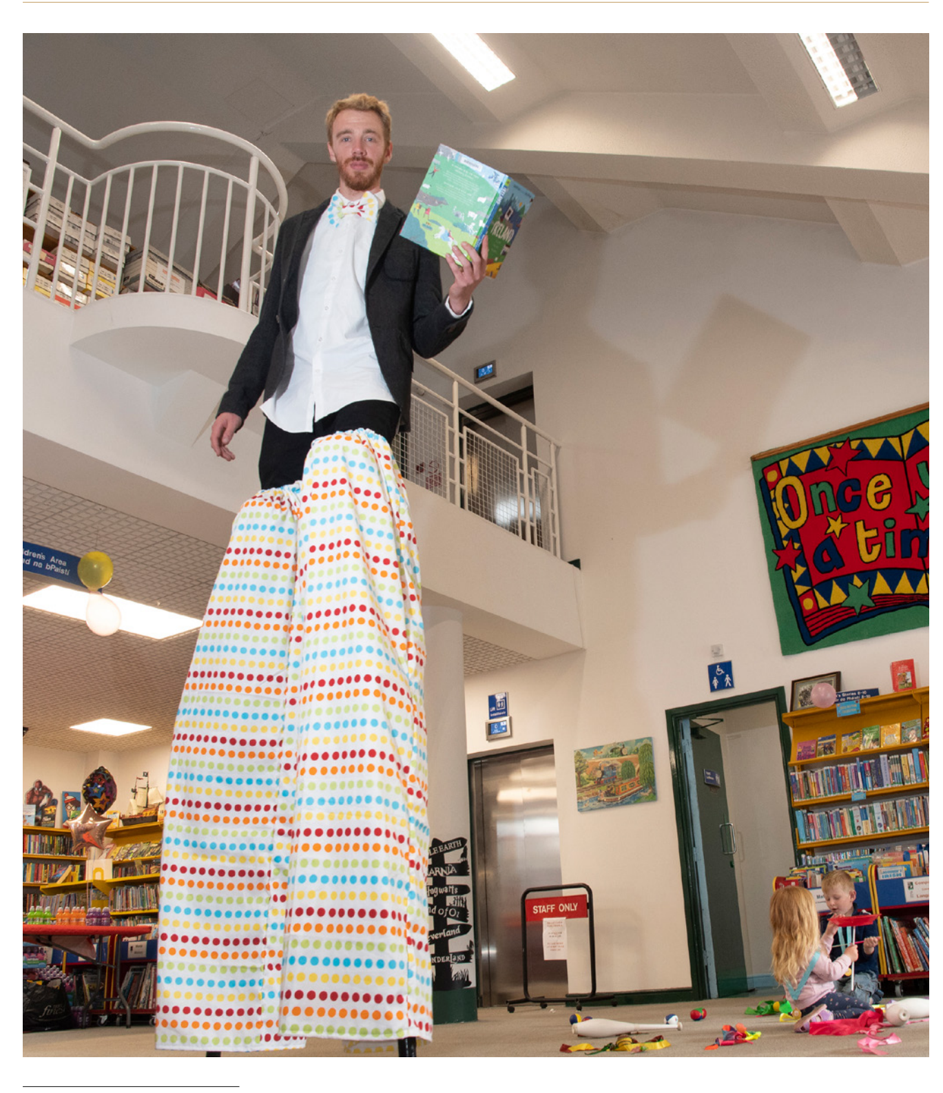
Children's Book Festival at Mayo Library.

Heritage, Architects, Sport, Environment, Irish Language, Tourism, Enterprise & Investment, Council Area Offices and Municipal Districts all working together for the public good. Through our extensive library, community, museums and arts infrastructure, we endeavour to reach all members of our communities. Some examples of collaborative partnerships leading to excellence are Music Generation Mayo (including the creation of a County Instrument Bank), Mayo Artsquad, Mayo Ideas Week, Mayo Men on the Move Programme, Heritage Week, Science Week and Children's Book Festival Month. The Creative Ireland Programme has strengthened and enhanced these partnerships.