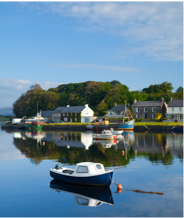
Newport, Co. Mayo. Tourism Department, Mayo County Council