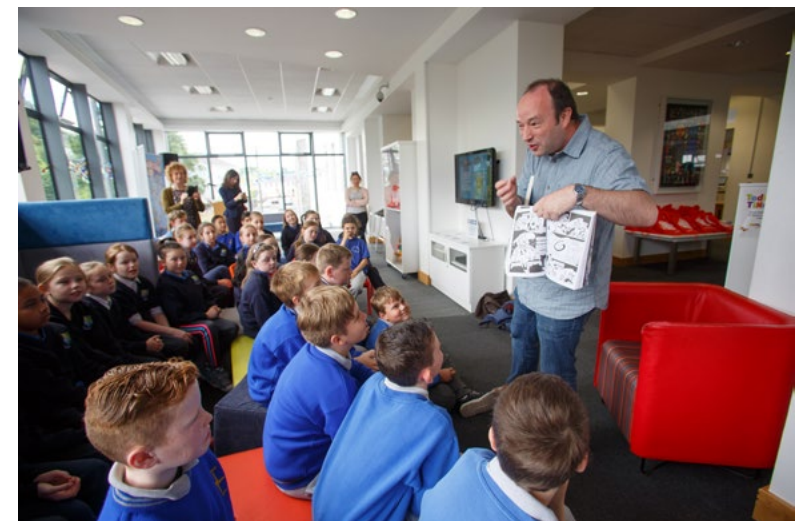
Ceardlanna cruthaitheacha do leanaí i Seirbhís Leabharlainne Uíbh Fhailí Children's creative workshops in Offaly Library Service