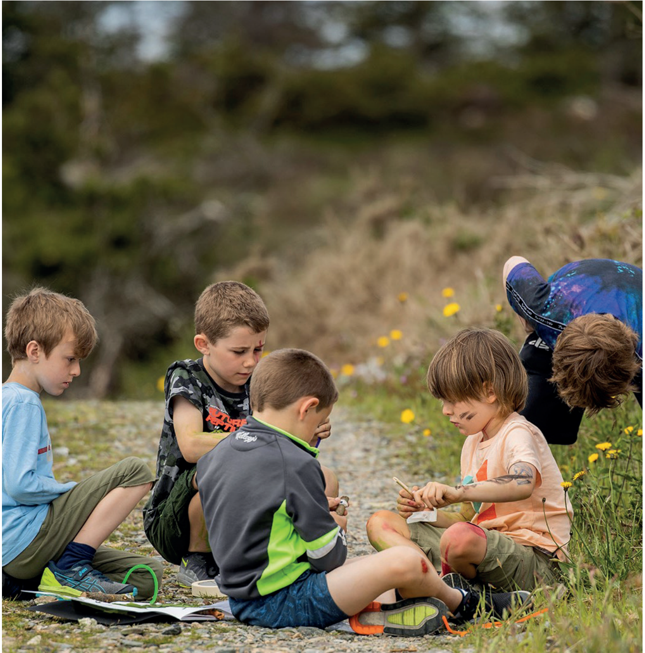
Tara Hills Art Trails Cruinniú na nÓg, Gorey School of Art.