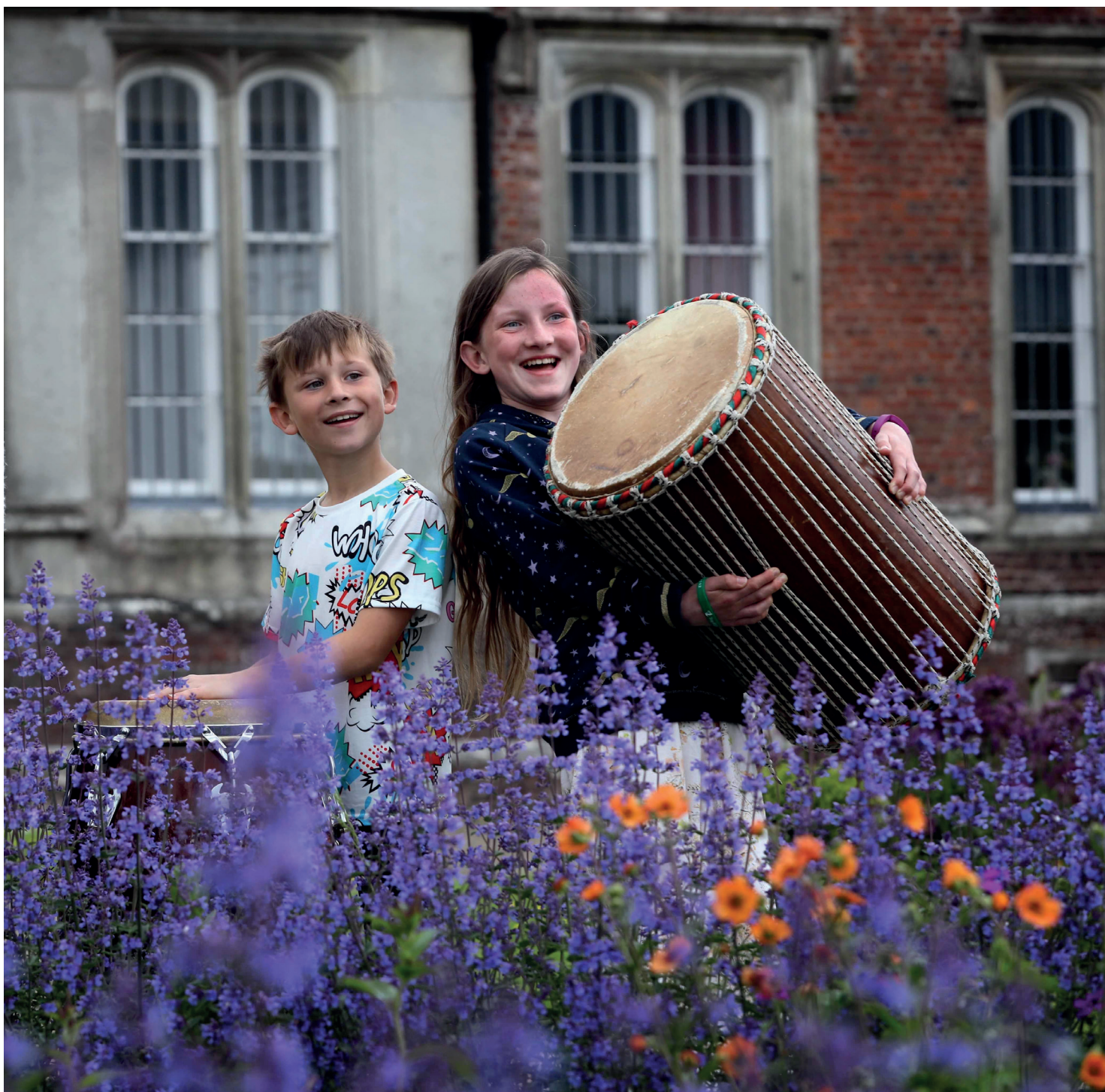
Beat Your Drum, Cruinniú na nÓg Wells House Gorey.