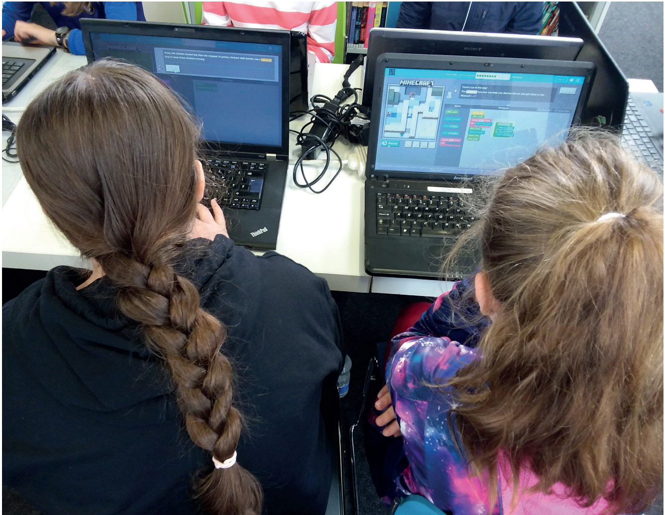
Creative Technology Workshop Wexford.