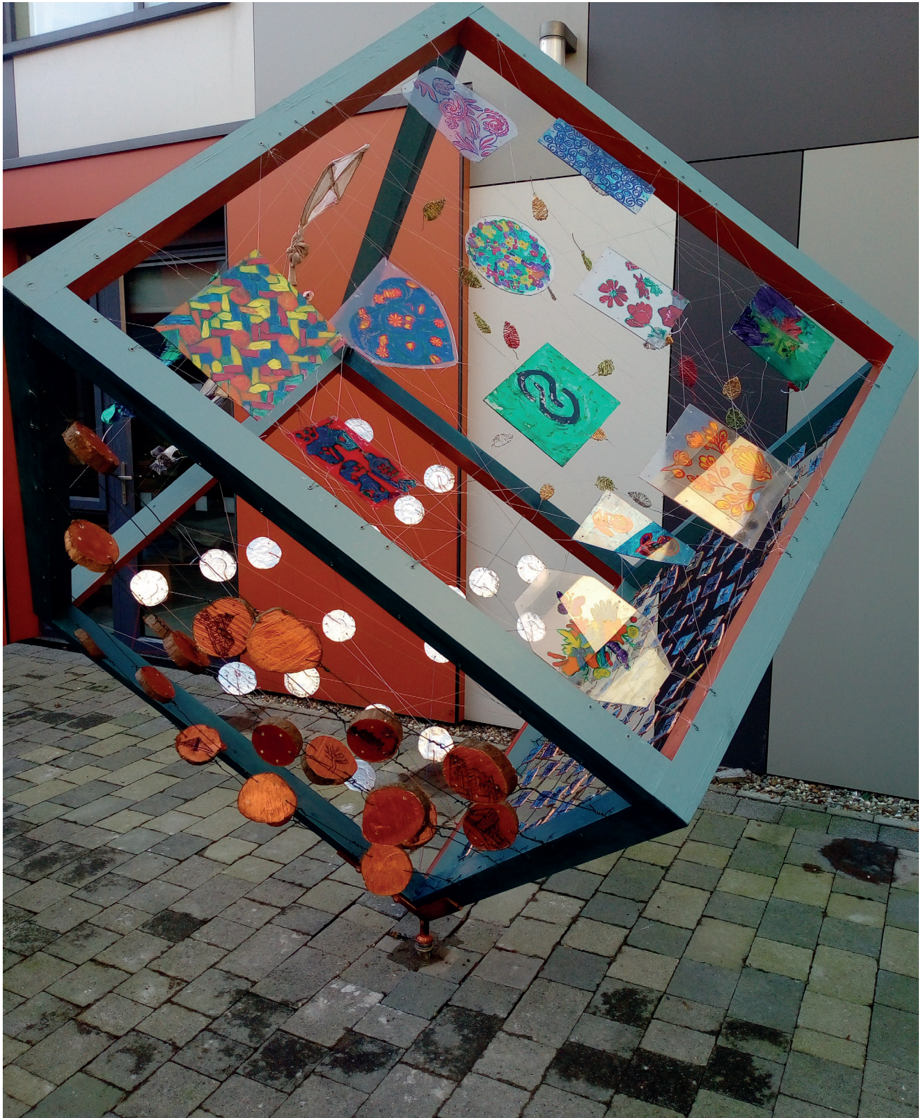
Curiosity of Purpose Sculpture from the Psychiatry of Later Life project, Wexford.