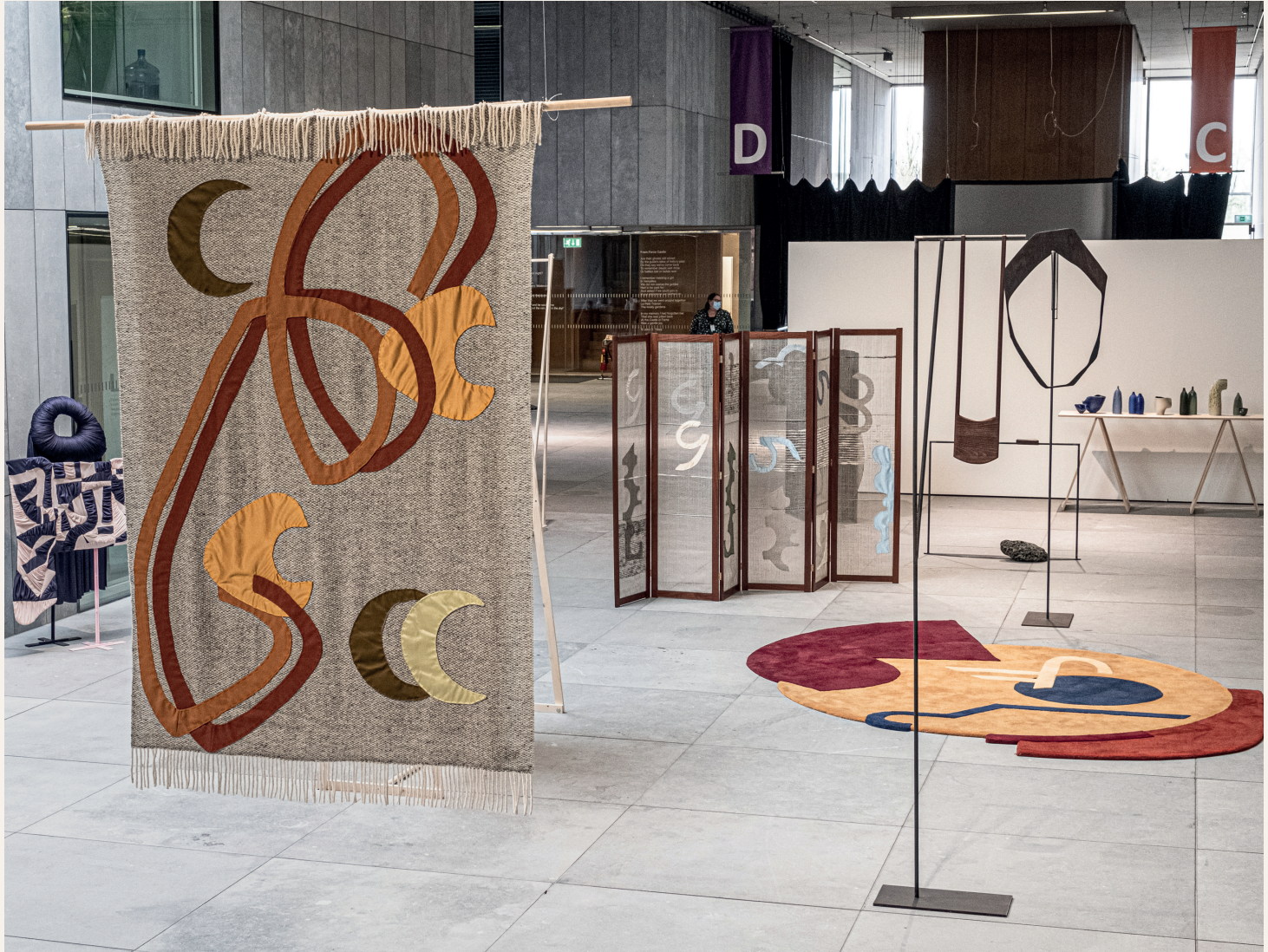
Making and Momentum 'In Conversation with Eileen Gray Exhibition', Wexford County Council.