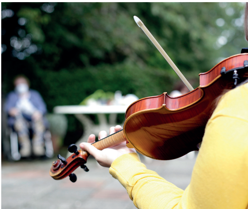
Covid Care Concert Wexford.