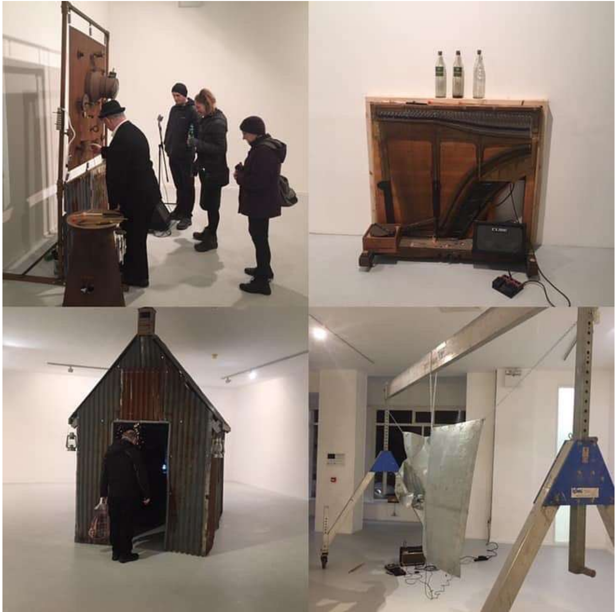
Tin Tabernacle Installation at Leitrim Sculpture Centre Gallery Culture Night 2019